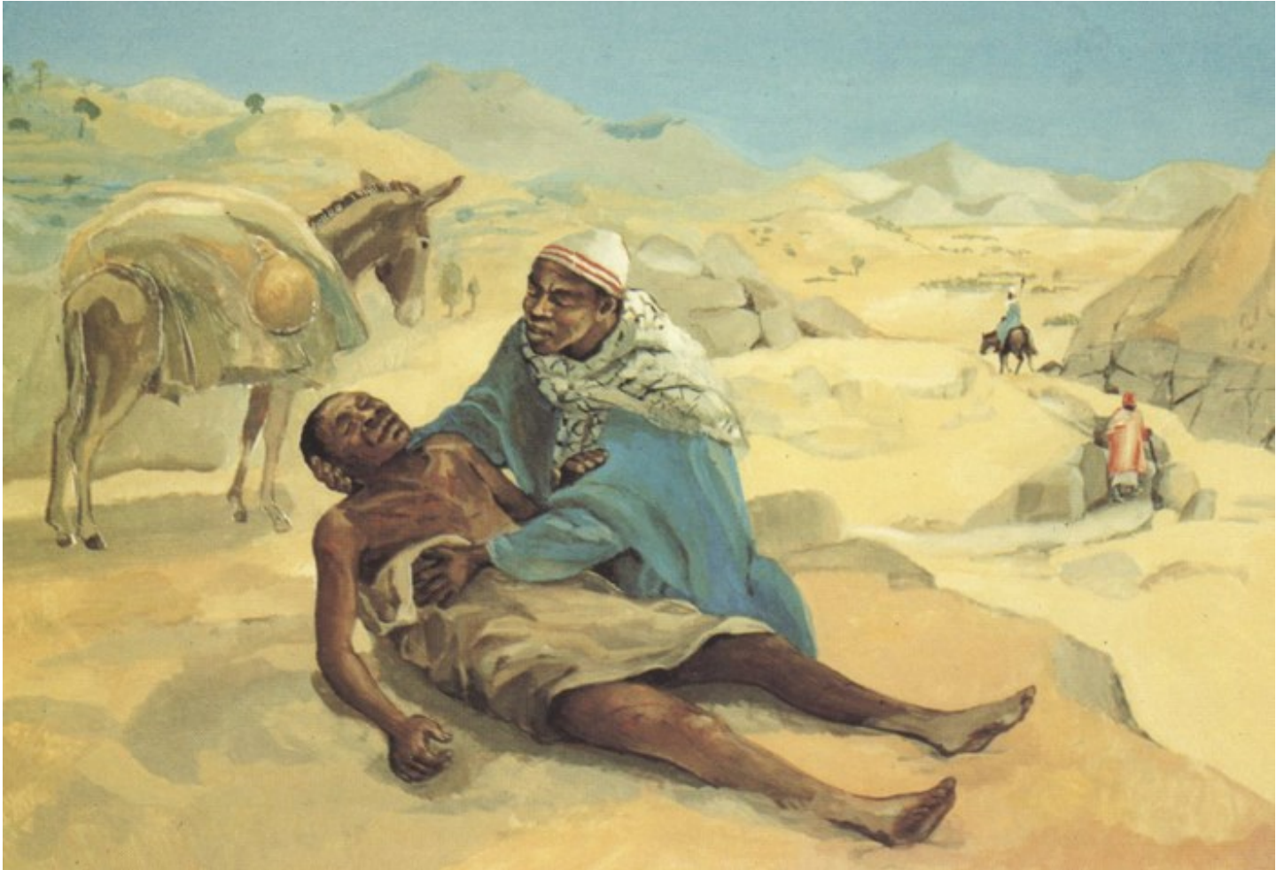
The Good Samaritan, Jesus Mafa Community, Cameroon

508 West Davis Street Burlington, North Carolina 27215 www.fpcburlington.org 336-228-1703