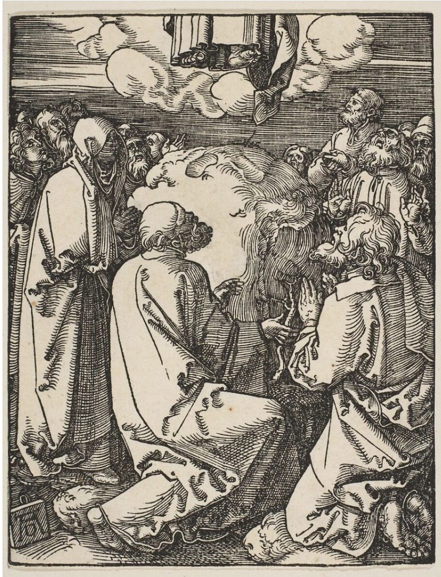
The Ascension, Albrecht Dürer

508 WEST DAVIS STREET BURLINGTON, NORTH CAROLINA 27215 www.fpcburlington.org 336-228-1703